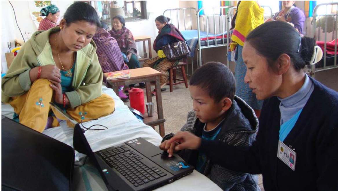
Educational support enables patients to stay in hospital when long-term care is needed.

United Mission Hospital provides free nutritious food and toys for children admitted in the hospital. Many children spend weeks or months in the hospital, which hinders their schooling. Since 2007, the hospital has been providing such children with continued education.