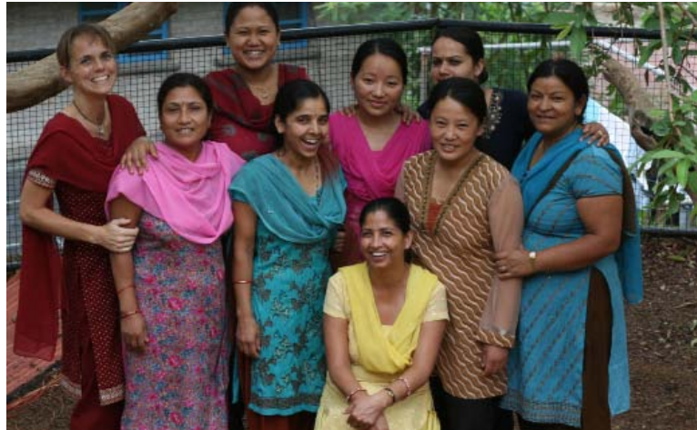
Recently graduated PNC students.