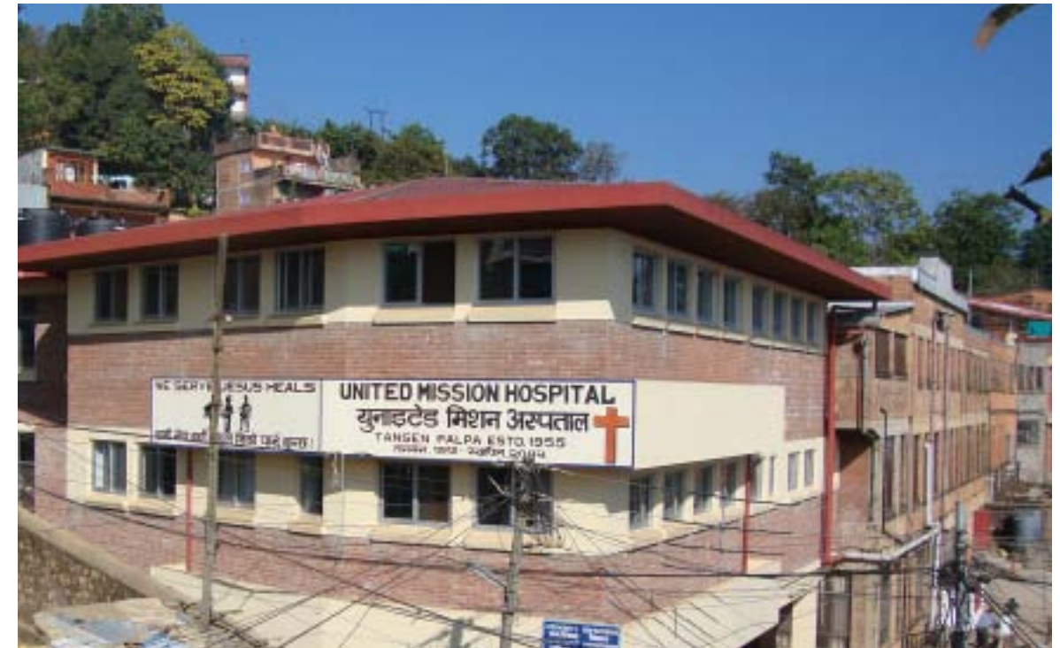
A front view of the hospital.

Pernilla Ardeby Pediatric Nurse from Sweden